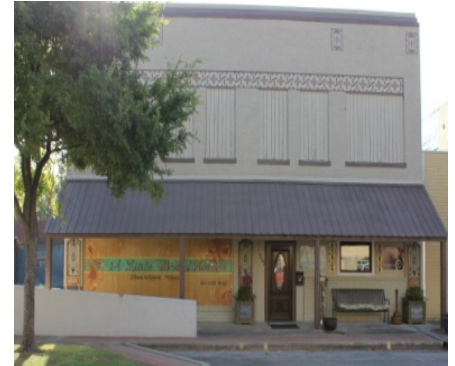
First Façade Grant Recipient

The applicant participates up to $2,500 of improvements and the RCCDF matches up to $2,500.